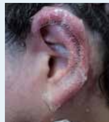
Figure 3: Cuticell Contact in place